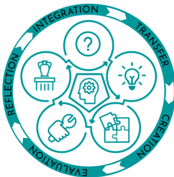
Figure 1: Transdisciplinary Project Cycle of Learning (adapted from OECD Learning Compass 2030)

For the purposes of this document, the term discipline is used to describe a recognised field of study or body of knowledge in a well-planned structure. Disciplines are defined by specialist knowledge, theories, concepts, methodology and terminology.