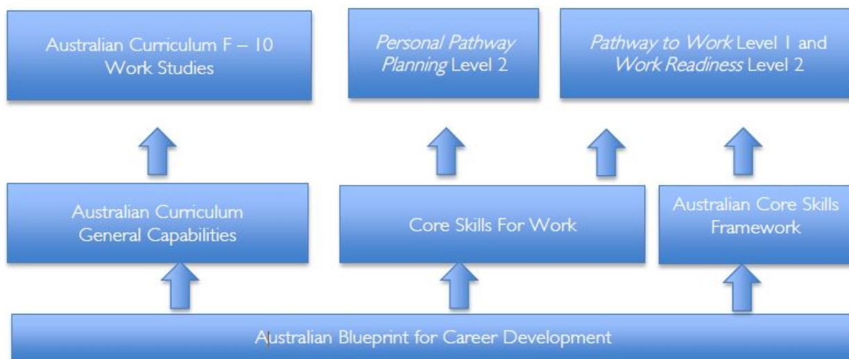
Diagram 1: Relationship between Australian Curriculum, Core Skills for Work Developmental Framework, Australian Core Skills Framework, Australian Blueprint for Career Development and TASC courses

Note: the combination of skills as detailed in the Australian Core Skills Framework and Core Skills for Work Developmental Framework are referred to as Foundation Skills in the vocational education and training (VET) sector. In the school sector these skills are described as General Capabilities and in the higher education sector they are referred to as Graduate Attributes.