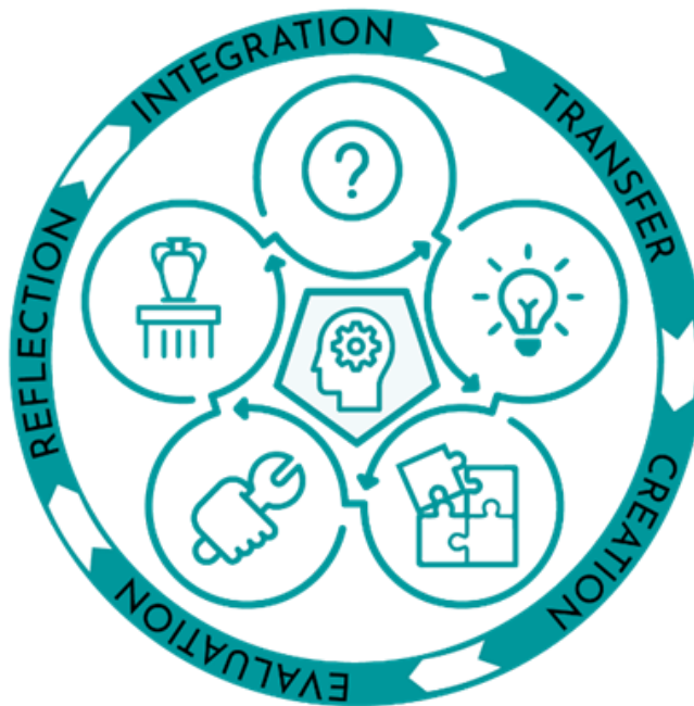
Figure 1: Transdisciplinary project cycle of learning adapted from OECD Learning Compass 2030

In this course learners will do this by: