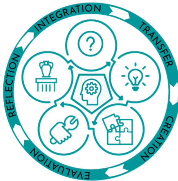
Figure 1: Transdisciplinary Project Cycle of Learning (adapted from OECD Learning Compass 2030)

For the purposes of this document, the term discipline is used to describe a recognised field of study or body of knowledge in a well-planned structure. Disciplines are defined by specialist knowledge, theories, concepts, methodology and terminology.