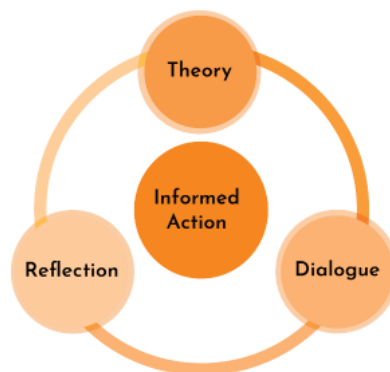
Figure 1: Transdisciplinary Project Cycle of Learning (adapted from OECD Learning Compass 2030)

In this course, learners will do this by: