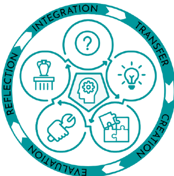
Figure 1: Transdisciplinary project cycle of learning (adapted from OECD Learning Compass 2030)

In this course learners will do this by: