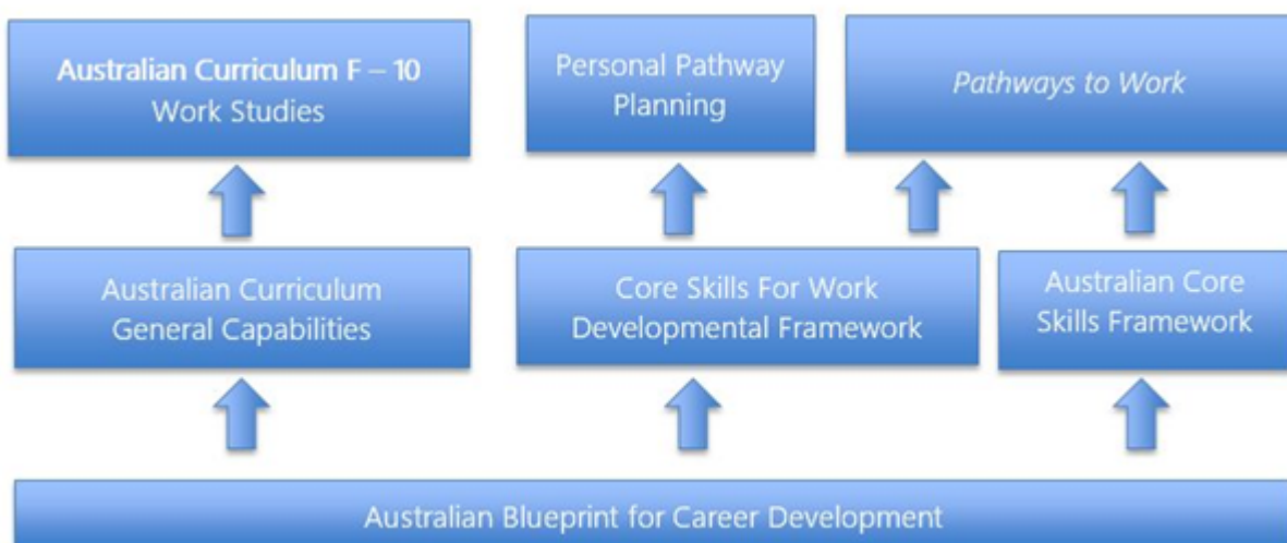
Diagram 1: Relationship between Australian Curriculum Core skills for Work Developmental Framework, Australian Core Skills Framework and TASC courses

Note: the combination of skills as detailed in the Australian Core Skills Framework and Core Skills for Work Developmental Framework are referred to as Foundation Skills in the vocational education and training sector. In the school sector these skills are described as General Capabilities and in the higher education sector they are referred to as Graduate Attributes.