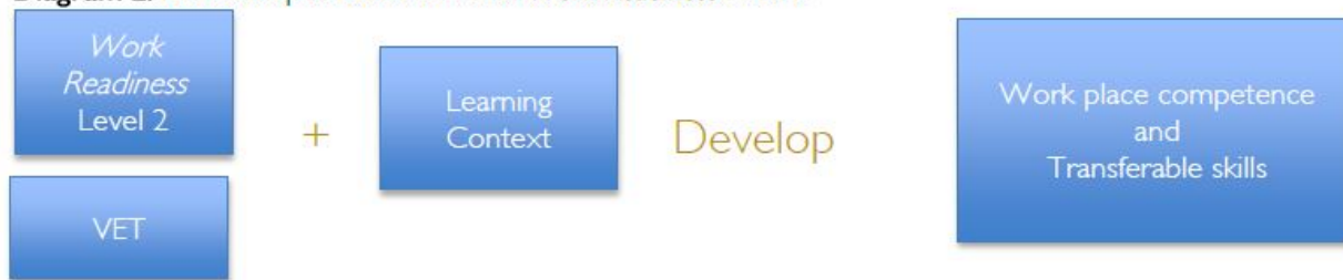
Diagram 2: Relationship between VET and Work Readiness Level 2