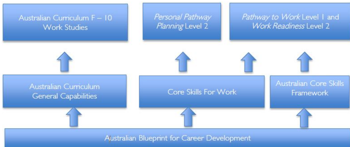
Diagram 1: Relationship between Australian Curriculum, Core Skills for Work Developmental Framework, Australian Core Skills Framework, Australian Blueprint for Career Development and TASC courses

Note: the combination of skills as detailed in the Australian Core Skills Framework and Core Skills for Work Developmental Framework are referred to as Foundation Skills in the vocational education and training (VET) sector. In the school sector these skills are described as General Capabilities and in the higher education sector they are referred to as Graduate Attributes.